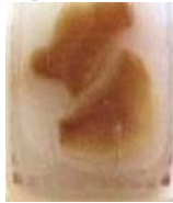
Tissue plaque from chicken meat on which Allah's name was not mentioned