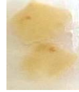
Tissue plaque from chicken meat on which Allah's name was mentioned