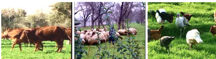
The study was applied on the three main sources of meat: cows, sheep and chickens